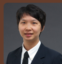
San Chaithiraphant Tilleke & Gibbins, Thailand