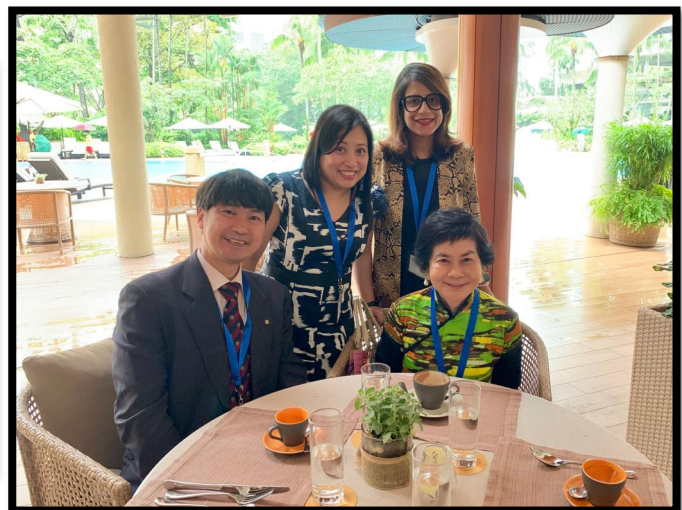
From across Asia - Malaysia – Singapore – Japan – Hong Kong