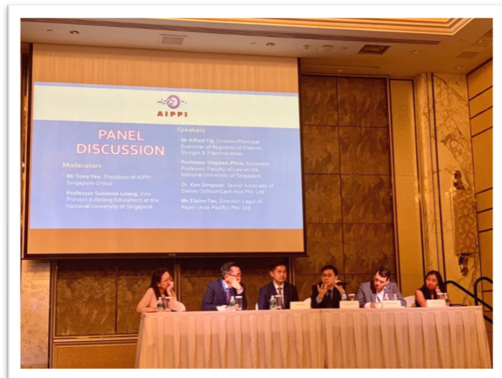
And wrapped up with a panel session