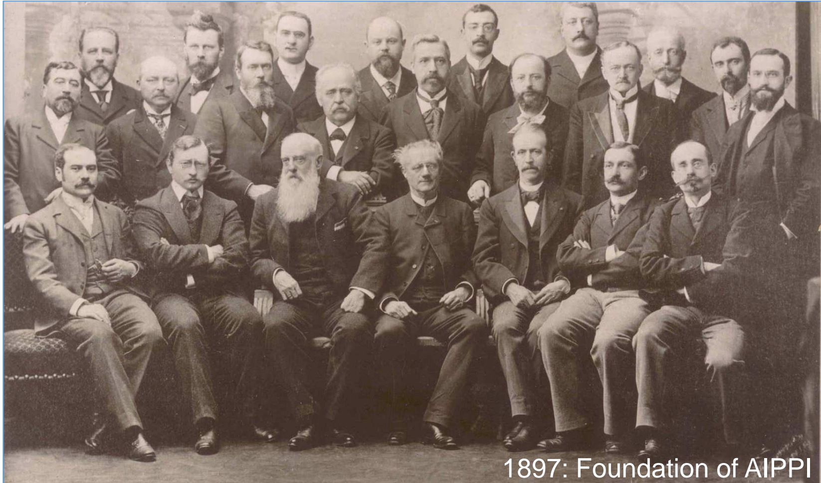
1897: Foundation of AIPPI