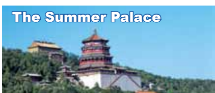
The Summer Palace

The Beijing Olympic Park is composed of the National Stadium, National Swimming Center (the Water Cube), and Nation Indoor Stadium. The Beijing National Stadium (The Bird's Nest) hosted both the Opening and Closing ceremonies of the 2008 Olympic Games and track and field games. Now it is also a comprehensive venue for sports, conference and entertainment.