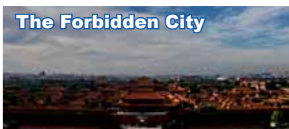
The Forbidden City

The Forbidden City, located in the center of Beijing city, used to be the imperial palace for the rule of 24 emperors of the Ming and Qing dynasties with a history of around 600 years and the off-limits to the ordinary citizens. Nowadays, as the Palace Museum, it opens to the public and introduces the history, culture and architecture art of ancient China to visitors from all over the world.