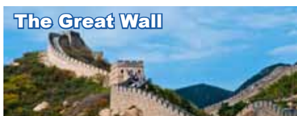
The Great Wall

The majestic Great Wall of China was built, as an ancient military defense fortification., Construction started over 2,000 years ago and extended through the Spring & Autumn Period and the Warring States Period. "Badaling" is at the heart of the Great Wall, where visitors will marvel at the architectural wonder.