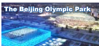
The Beijing Olympic Park

The Beijing Olympic Park is composed of the National Stadium, National Swimming Center (the Water Cube), and Nation Indoor Stadium. The Beijing National Stadium (The Bird's Nest) hosted both the Opening and Closing ceremonies of the 2008 Olympic Games and track and field games. Now it is also a comprehensive venue for sports, conference and entertainment.