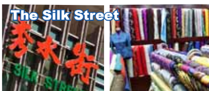
The Silk Street

The Forbidden City, located in the center of Beijing city, used to be the imperial palace for the rule of 24 emperors of the Ming and Qing dynasties with a history of around 600 years and the off-limits to the ordinary citizens. Nowadays, as the Palace Museum, it opens to the public and introduces the history, culture and architecture art of ancient China to visitors from all over the world.