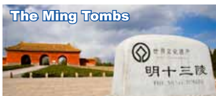
The Ming Tombs

The majestic Great Wall of China was built, as an ancient military defense fortification., Construction started over 2,000 years ago and extended through the Spring & Autumn Period and the Warring States Period. "Badaling" is at the heart of the Great Wall, where visitors will marvel at the architectural wonder.